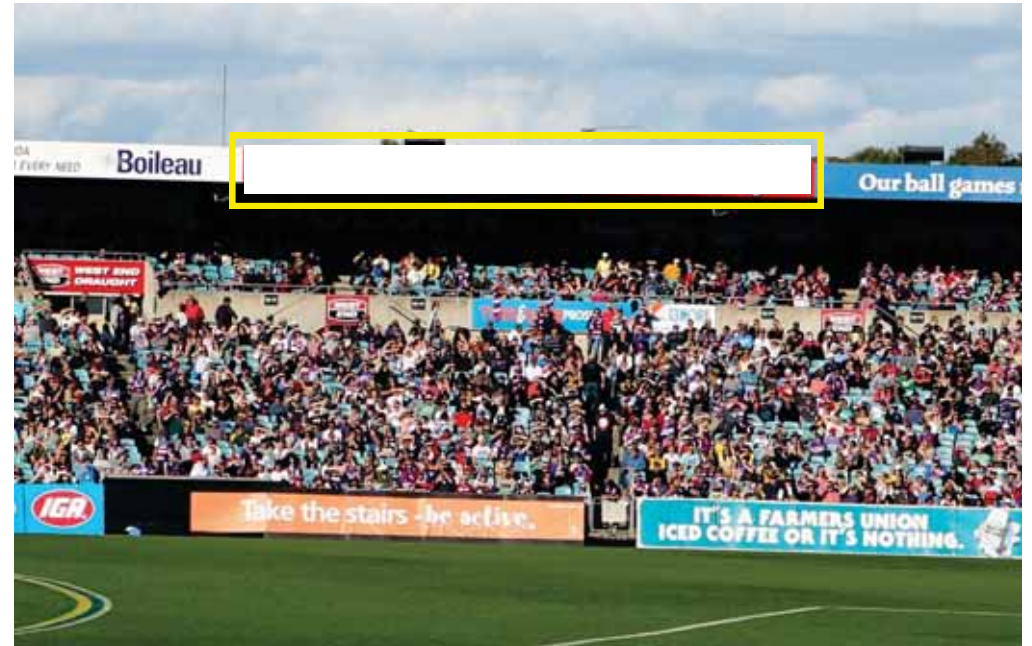
EASTERN CONCOURSE SIGN # 34

* Please note production costs are sponsor's responsibility