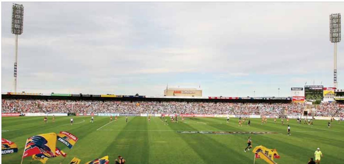
LIGHT TOWERS # 1, 2, 3 & 4 - TOWERS 3 & 4 PICTURED ABOVE