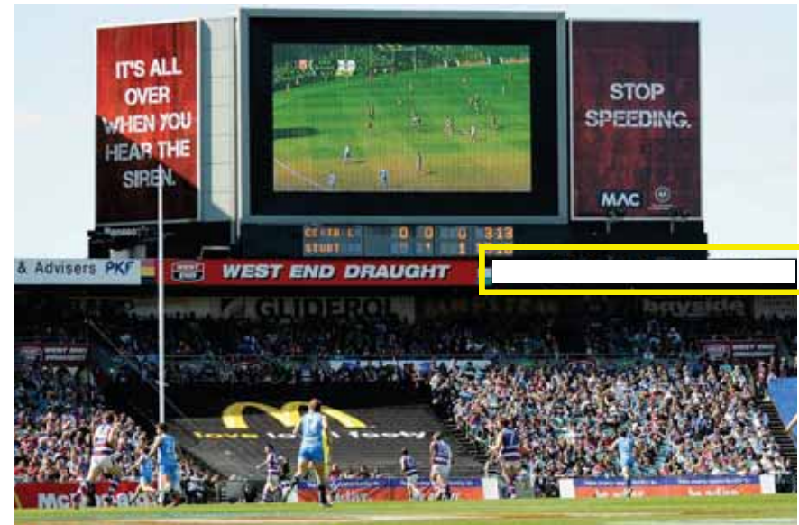
NORTH EASTERN CONCOURSE SIGN #29

* Please note production costs are sponsor's responsibility