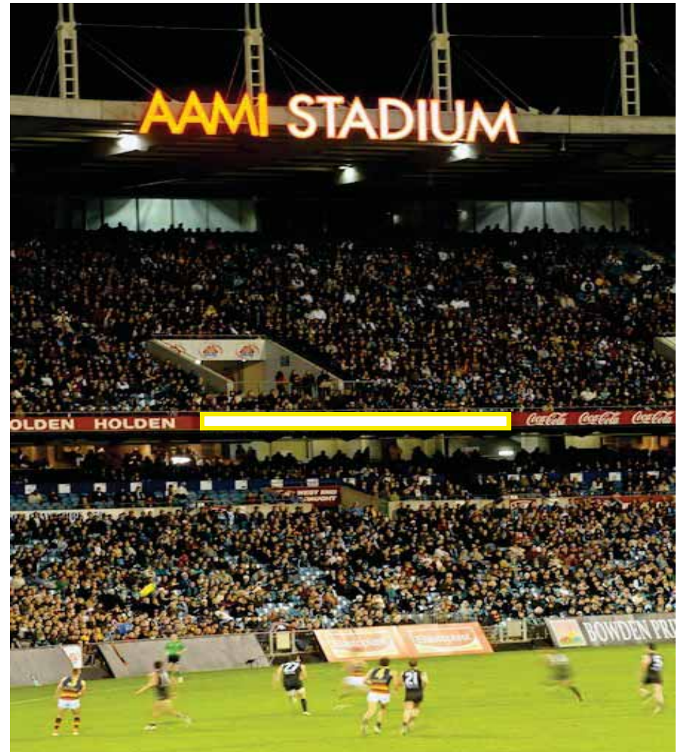
NORTHERN CONCOURSE SIGN #24