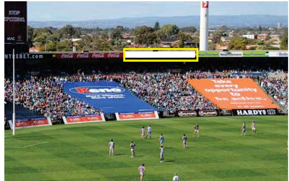
EASTERN CONCOURSE SIGN # 31

* Please note production costs are sponsor's responsibility